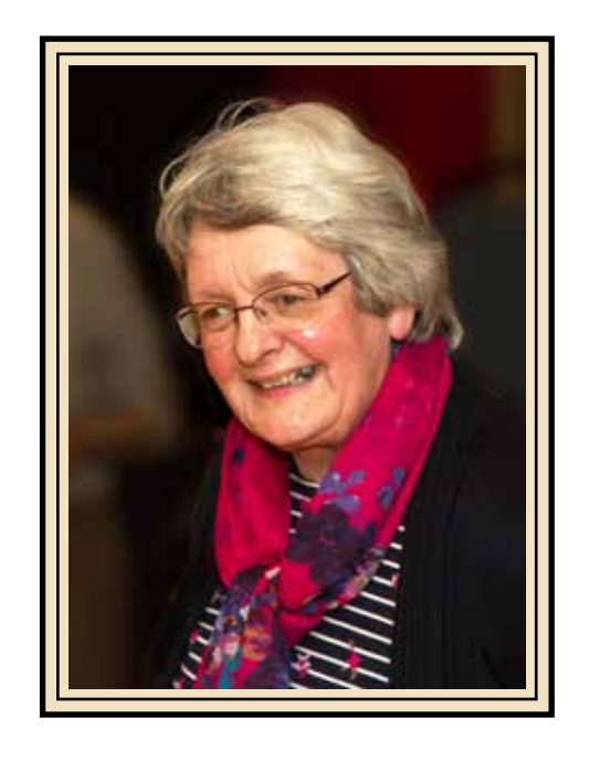
All Saints Church, Weston Thursday, 12th October, 2023