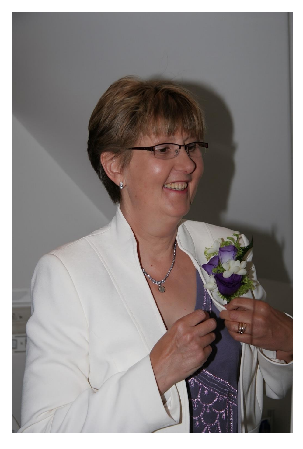
All Saints Weston, Bath Monday 21st July 2025 at 2.30pm

6<sup>th</sup> March 1948 – 26<sup>th</sup> June 2025